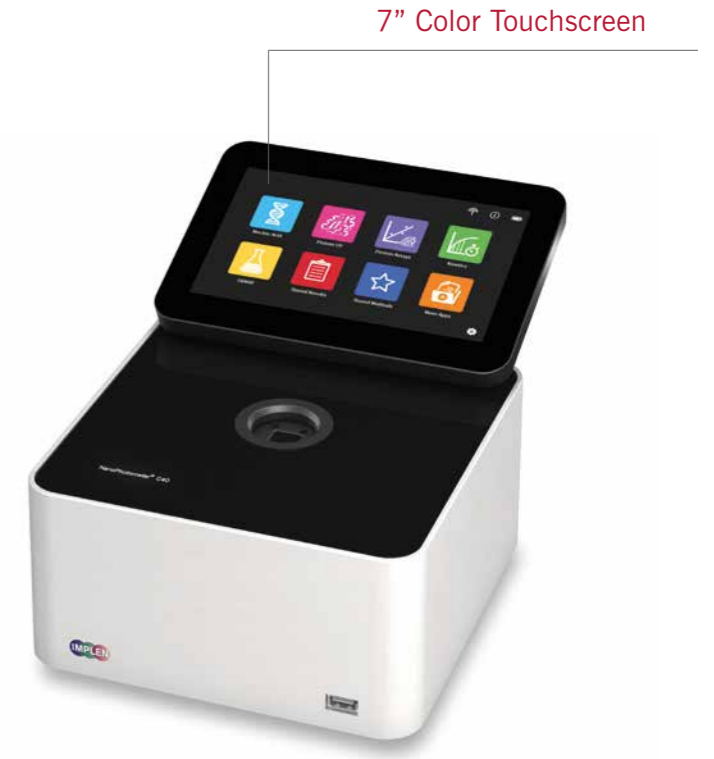
7" Color Touchscreen