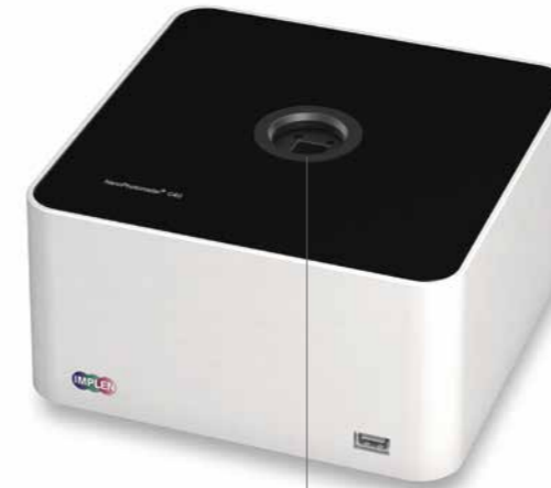
Temperature Controlled Cuvette Holder